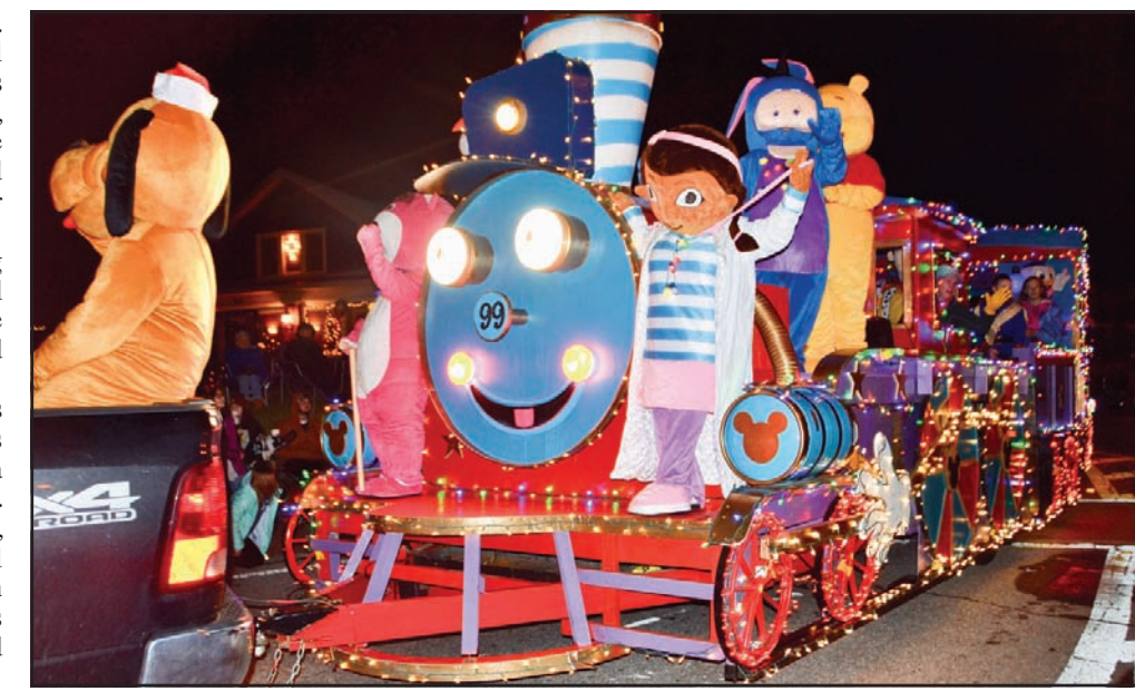
The Nighttime Christmas Parade will roll through Downtown Blairsville this Saturday. Pictured here: a 2018 parade float.

As "something that the See Christmastime, Page 2A