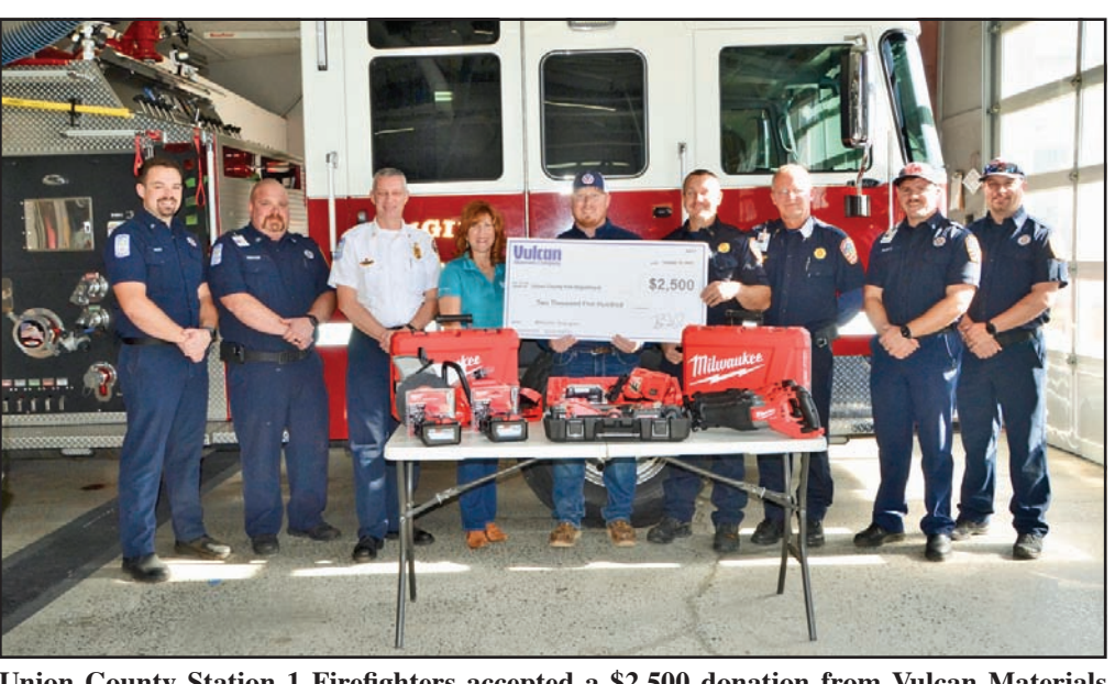
Union County Station 1 Firefighters accepted a $2,500 donation from Vulcan Materials Company on Nov. 18.