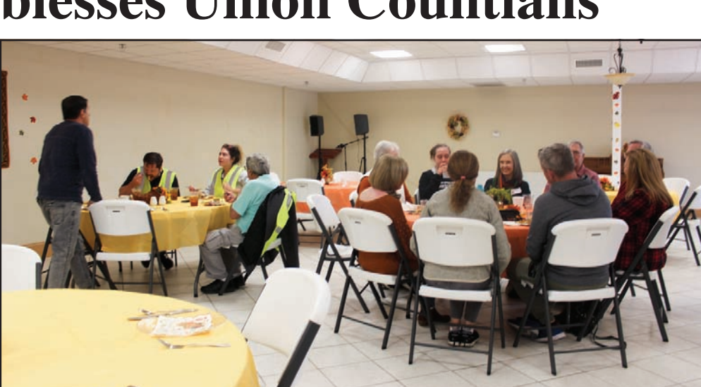
Volunteers and church members took the time to break bread together during the Thanksgiving Blessings Dinner inside the Family Life Center of House of Prayer Church last week.